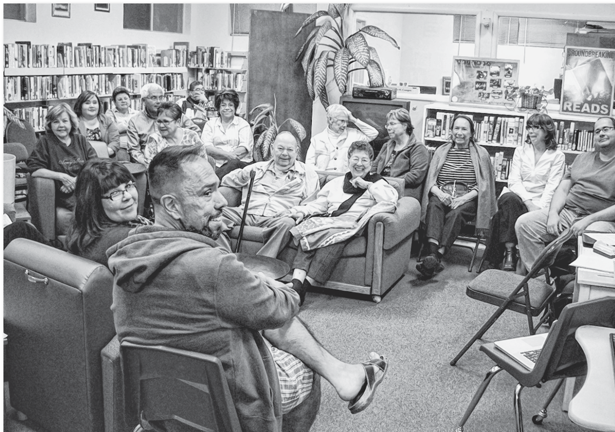
Superior residents attend a workshop on time at the Superior Public Library.