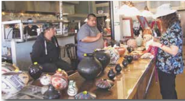
Visitors talk to the Mata Ortiz Pottery artists.