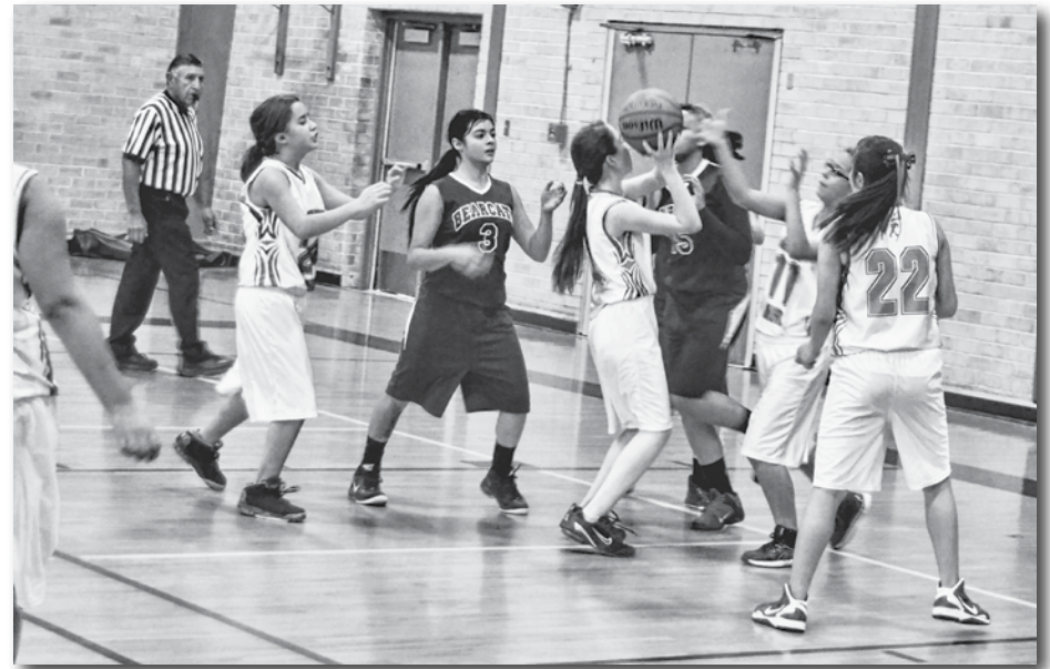
Ray's eighth grade Lady Bearcats face off against San Manuel in a loss last week.