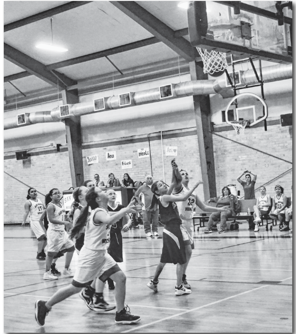
Ray's seventh grade Lady Bearcats face off against San Manuel in a win last week.

Games against Cibecue on January 29 and at Ft. Thomas on January 31 follow the San Manuel game. All games are scheduled to tipoff at 5:30 p.m.