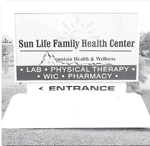
Sun Life in San Manuel can help you navigate the health insurance ‘marketplace’.