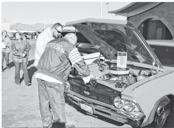
People enjoying the inside of the vehicles.