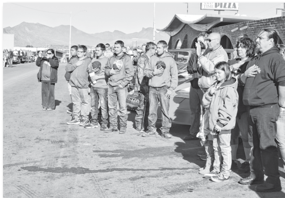
Spectators pay their respects to the flag as the Ray High School ROTC opens ceremonies.