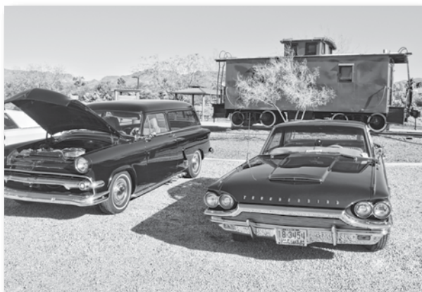
Many vehicles to enjoy at the Napa K-Town Car Show.