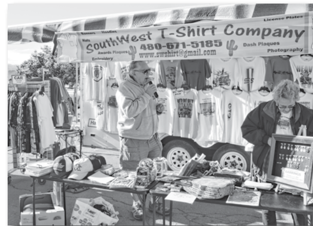
Vendors enjoying the day selling t-shirts.