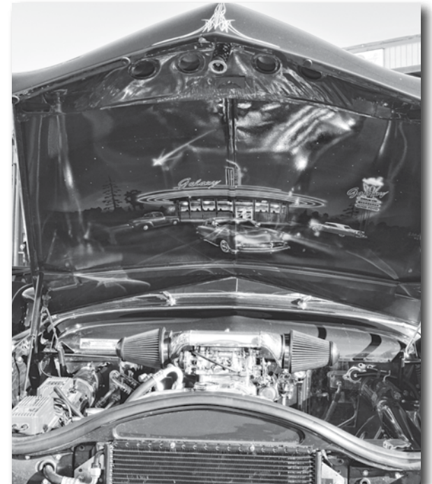
Creative painted inside of car hood.