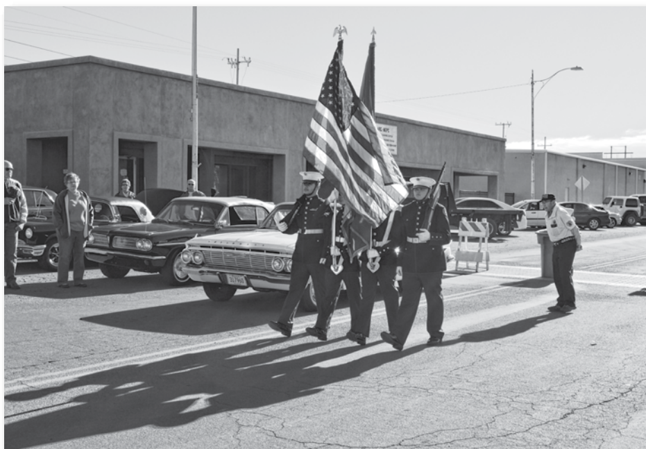
Ray HS ROTC performing at the Kearny Car Show.