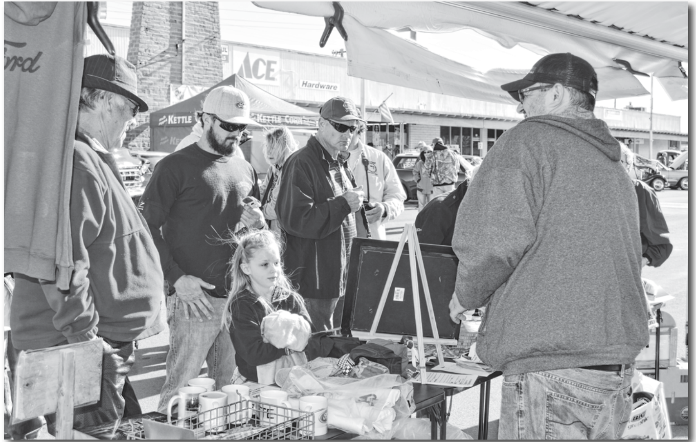
Vendors and people enjoying Kearny Car Show.