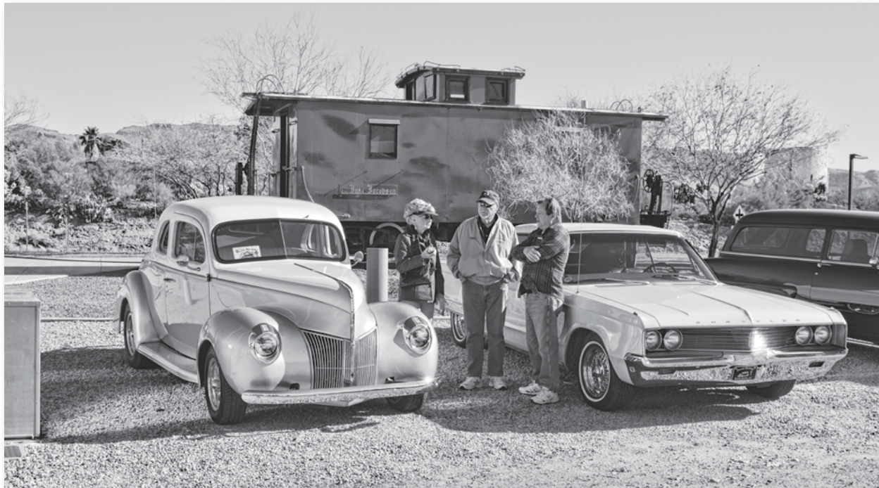
Many vehicles to enjoy at the Napa K-Town Car Show.