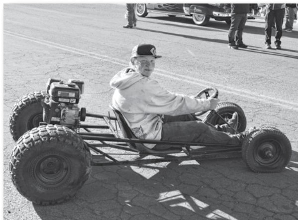
Even the young have fun.