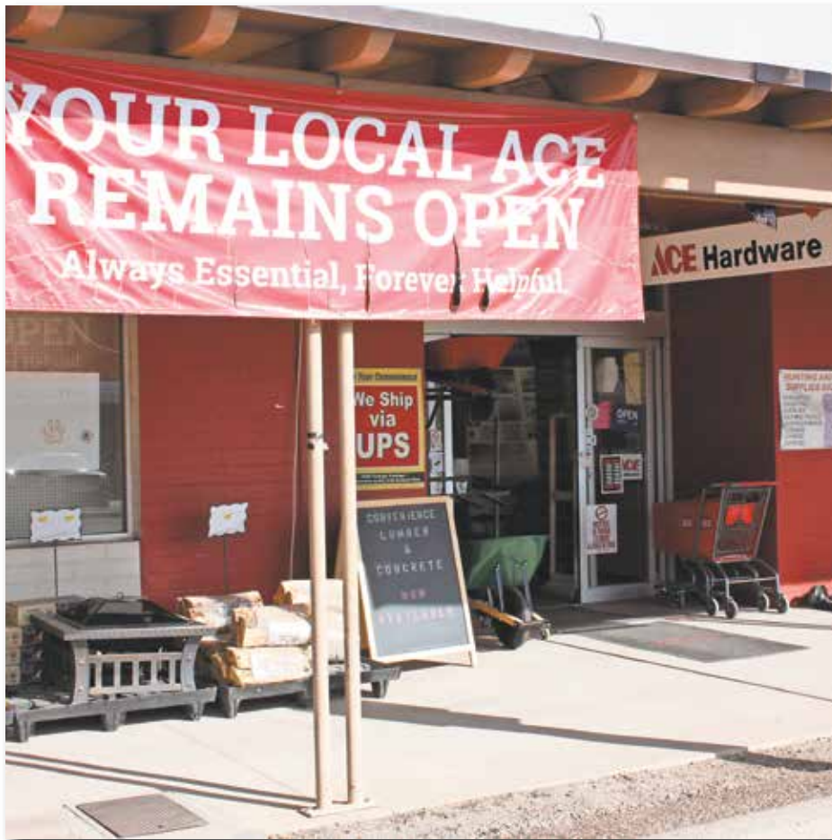
Kearny ACE Hardware has been in business for 15 years and is always essential.

Kearny Ace Hardware is located at 346 Alden Rd. They are open Monday through Saturday 8 a.m. to 6 p.m. and 8 a.m. to 4 p.m. on Sunday. The store's phone number is 520-363-7346.