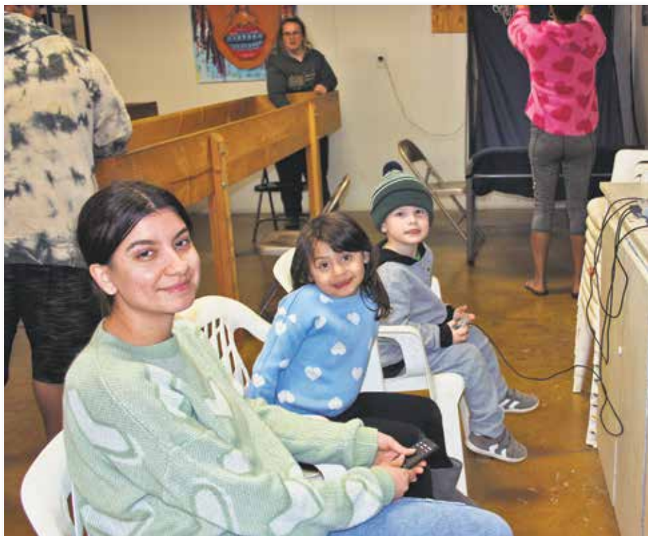
Friday was a cold day in Kearny. The Kearny Library Activity Center provided fun activities in a warm place.