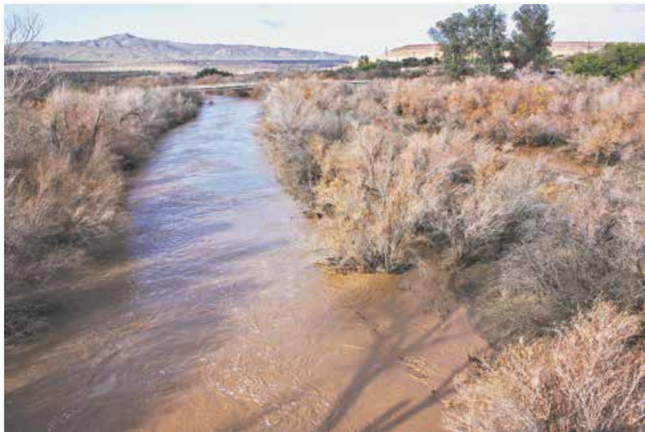
The Gila River was running out of its banks in Winkelman Tuesday morning last week.