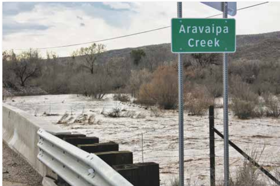
Aravaipa Creek was up and running.