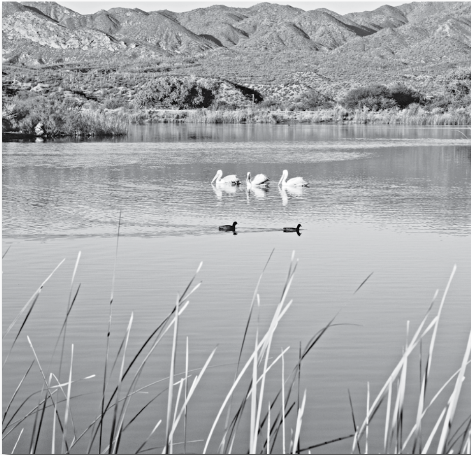
The Kearny Lake is one of the many tourism assets of the Copper Corridor.

To get the tourism effort going, the report suggests partnering with the business community to promote downtown redevelopment, beautification and technical business assistance. It also suggests partnering with government and nonprofit organizations such as