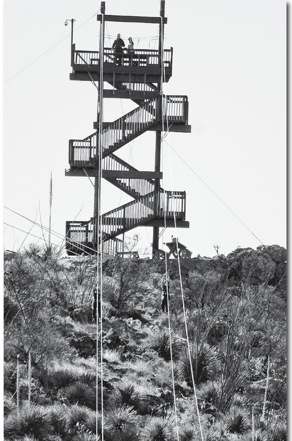
The AZ Ziplines Adventures is one of the new tourism based businesses now open in the Copper Corridor.