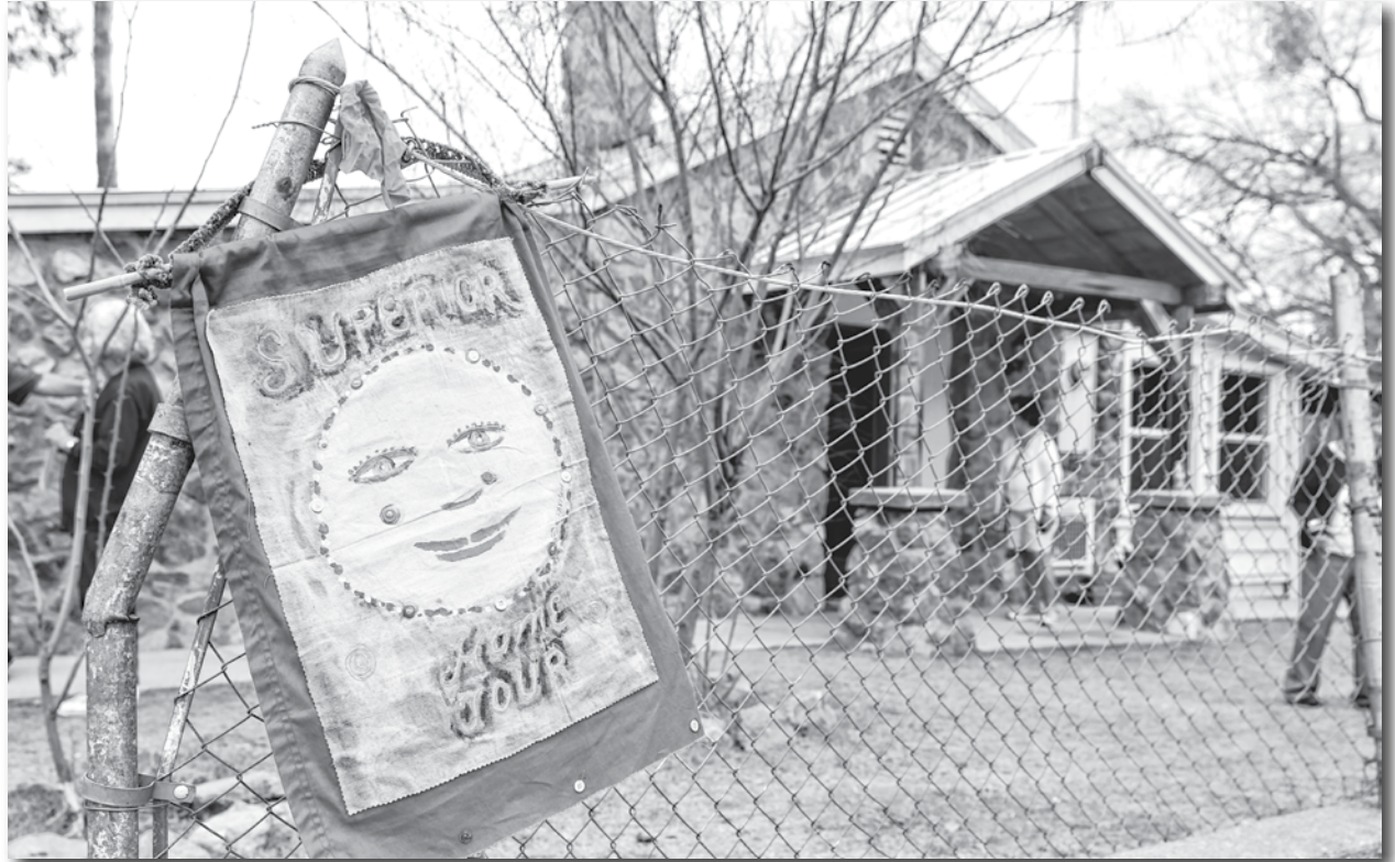
Homes and buildings in Superior will be open for visitors to tour this weekend.

As a bonus for all ticket holders – receive 2 for 1 passes to the Boyce Thompson Arboretum and the Renaissance Festival. The Home Tour is scheduled for Saturday, Jan. 28, 9 a.m. to 5 p.m. and Sunday, Jan. 29, 9 a.m. to 4 p.m.