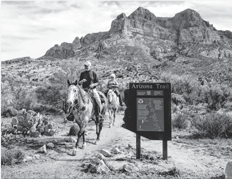
The Arizona Trail, which traverses the entirety of the Copper Corridor from Superior to Oracle, offers many tourist opportunities.