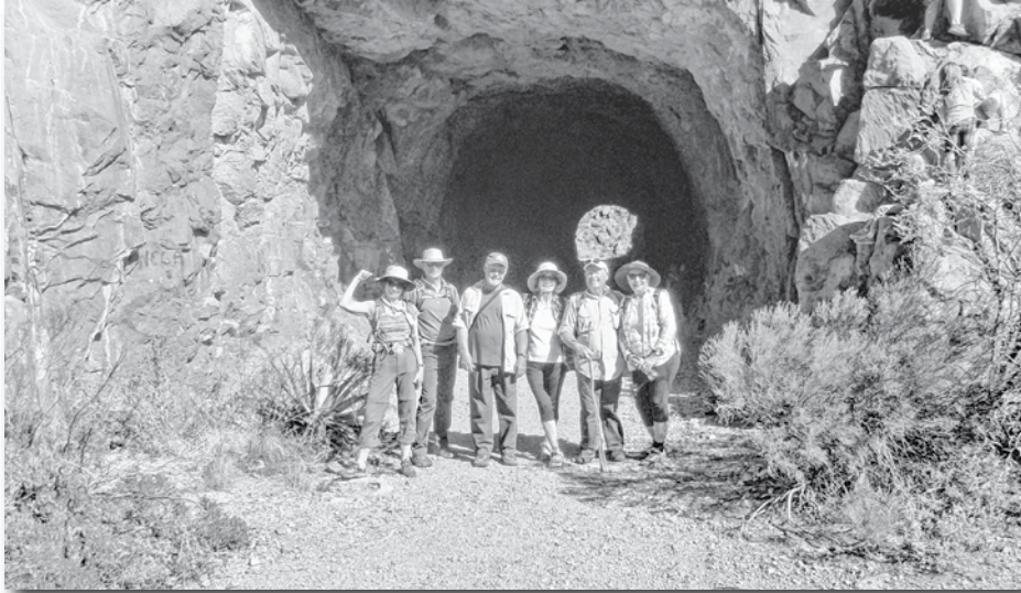
The Legends of Superior Trail (LOST) connects Superior to the Arizona Trail and is a major draw for tourists.

crowd, residents from the western provinces of Canada also can be targeted as potential tourists.