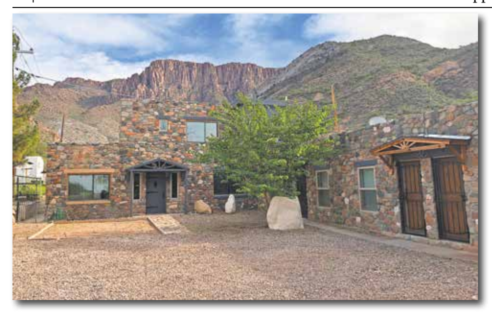
Element 29 with the fabulous Apache Leap in the background will be one of the stops on the Superior Home and Building Tour this weekend.