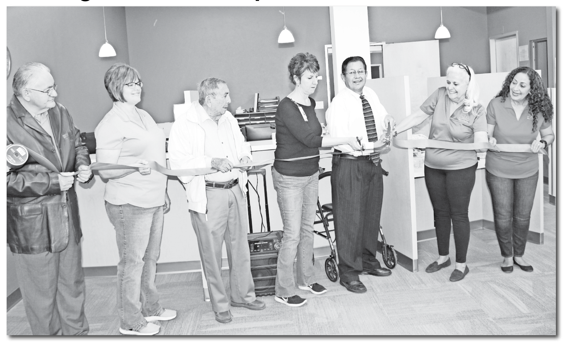
Sun Life Board Members and Officials 'cut' the ribbon, making the grand opening of the new Sun Life Building in Oracle official.