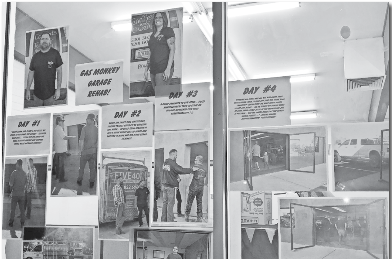
An array of photos from the Kearny Glass & Automotive's appearance on Gas Monkey Garage Rehab.