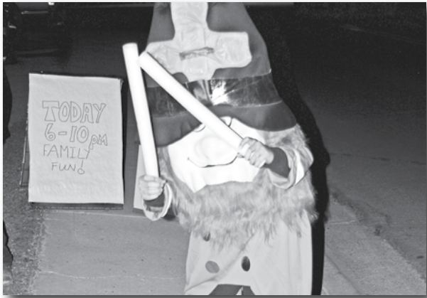
The Leprechaun was the star of the show. James Carnes | CBN