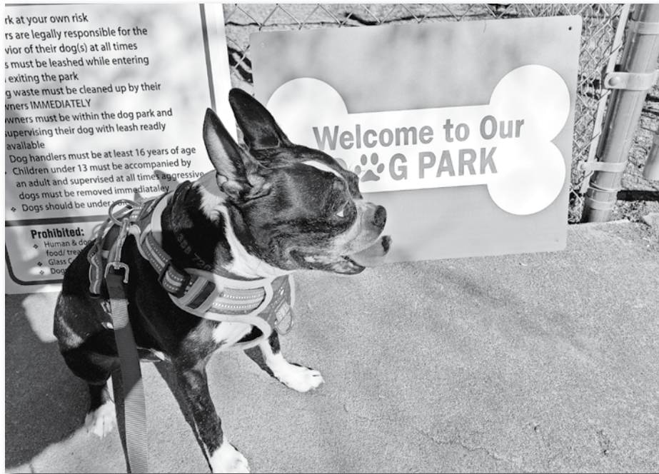
Even the poochies have a place to play – at the Dog Park!