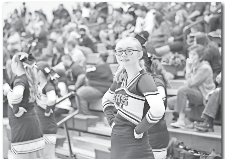
Cheering on the home team.