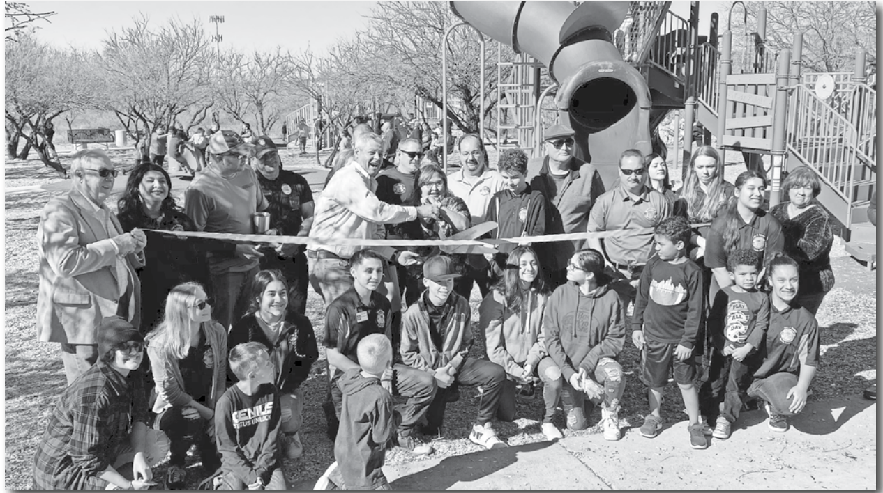
The official ribbon is cut and the park is open!