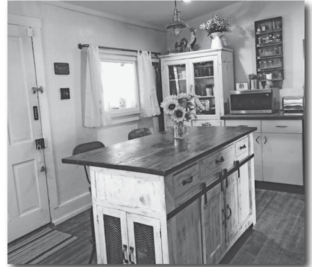
Adobe home's kitchen, before (left) and after (right).