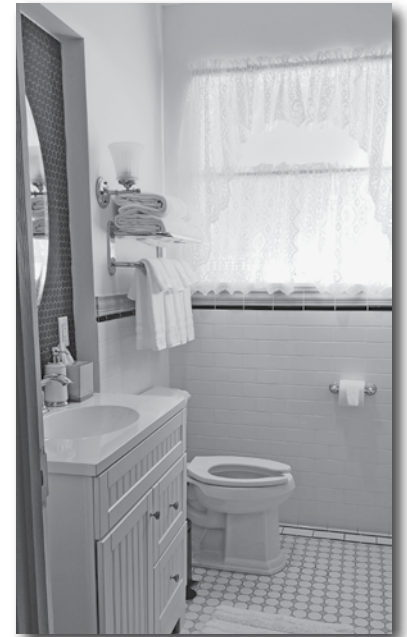
Magma Hotel bathroom, before (left) and after (right).