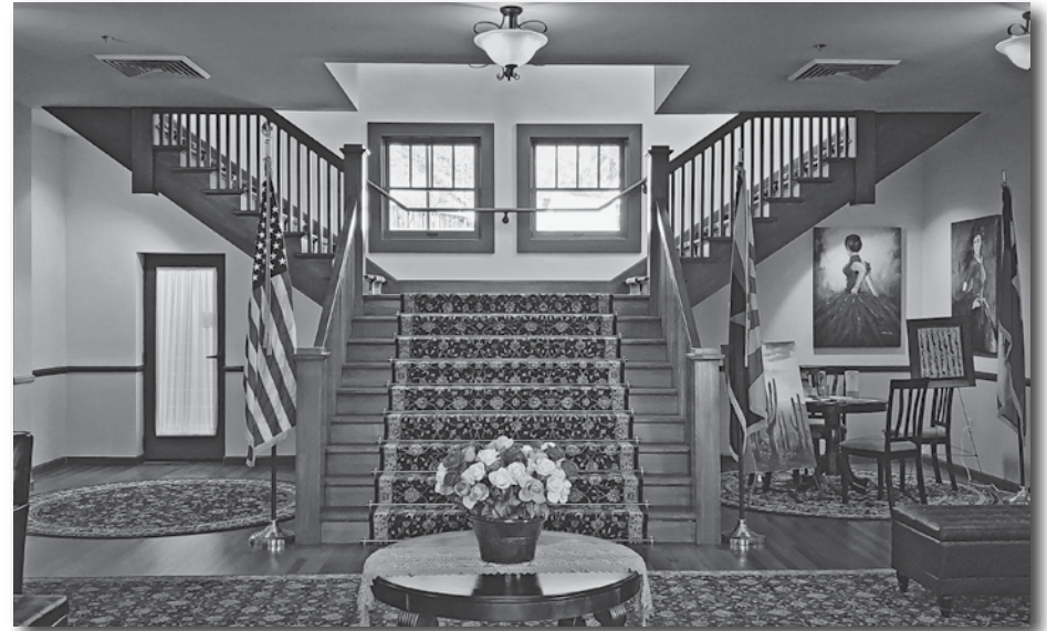
Magma Hotel Lobby, before (left) and after (right).