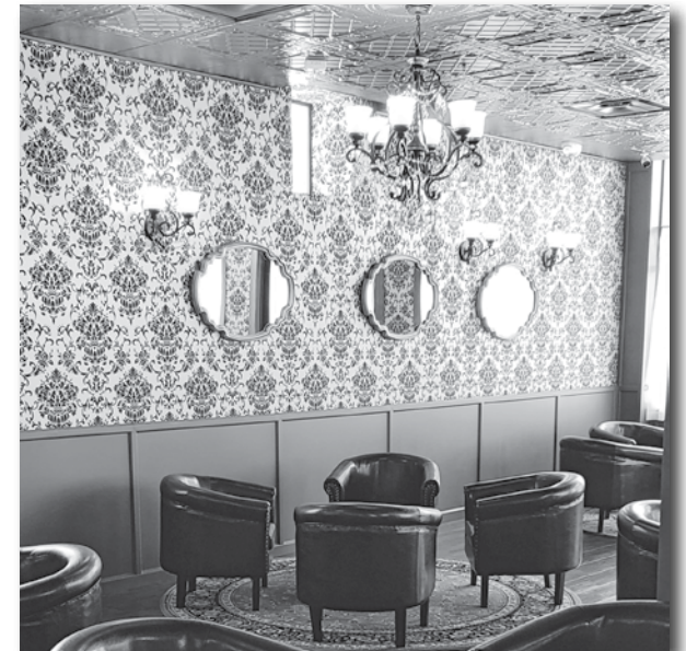
Magma Hotel Tea Room, before (left) and after (right).