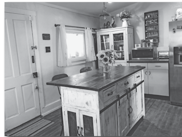
Adobe home's kitchen, before (left) and after (right).