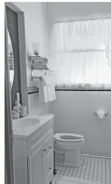
Magma Hotel bathroom, before (left) and after (right).