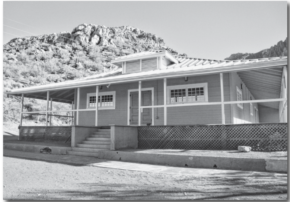
The Magma Club (c. 1920) will be one of the featured buildings on the Home and Building Tour this weekend. Submitted

For more information or to purchase your Home Tour tickets please call the Superior Chamber of Commerce at 520-827-0200 or visit them online at www.superiorarizonachamber.org .