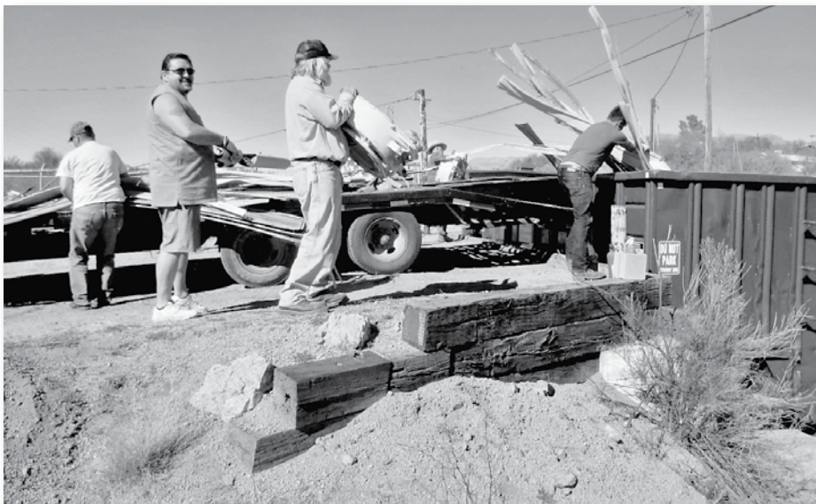
Working the last load of waste.