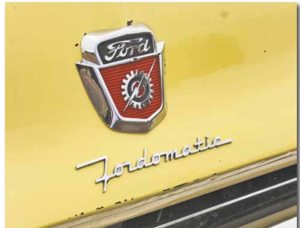
More than 100 classic cars and hot rods will line Alden Rd. Saturday. Be sure to come enjoy the experience. Jennifer Carnes | CBN

For more information about natural gas safety, visit swgas.com/safety or call 1-877-860-6020 .