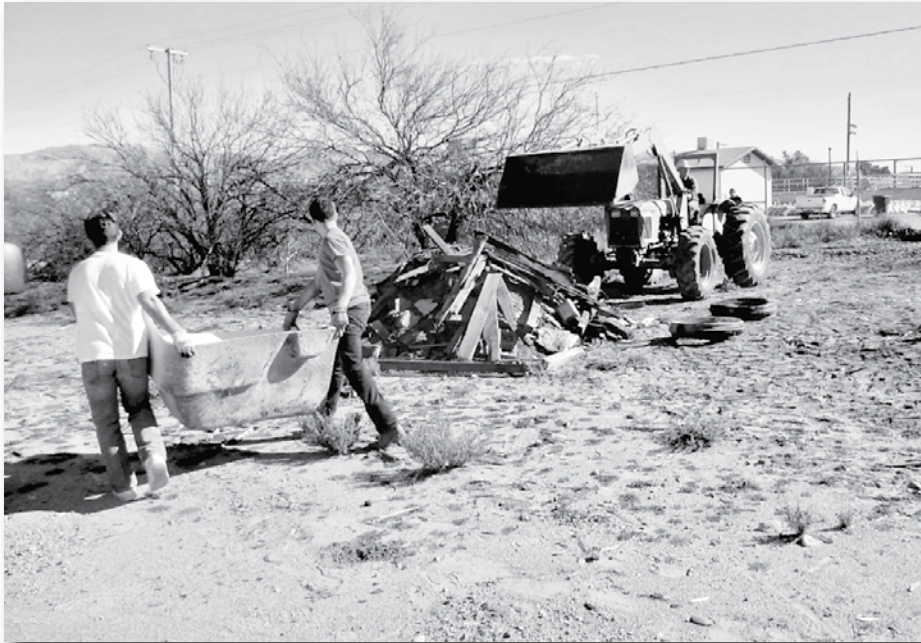
Volunteers bringing a load in for disposal.

I have a hunch, a solid and positive feeling, that many good things will be taking place in the next few months. I hope to bring more good news as we move deeper into 2015.