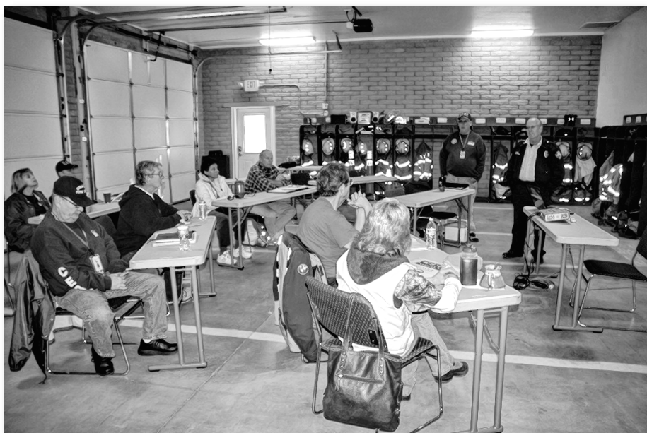
The CERTs training course is a combination of classroom and hands-on exercises.

For further information: www.oraclefire.org .