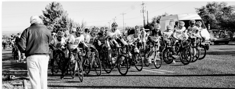
At the 2015 starting line.

Event parking is available at the Extension Office, near the Oracle Justice Court.