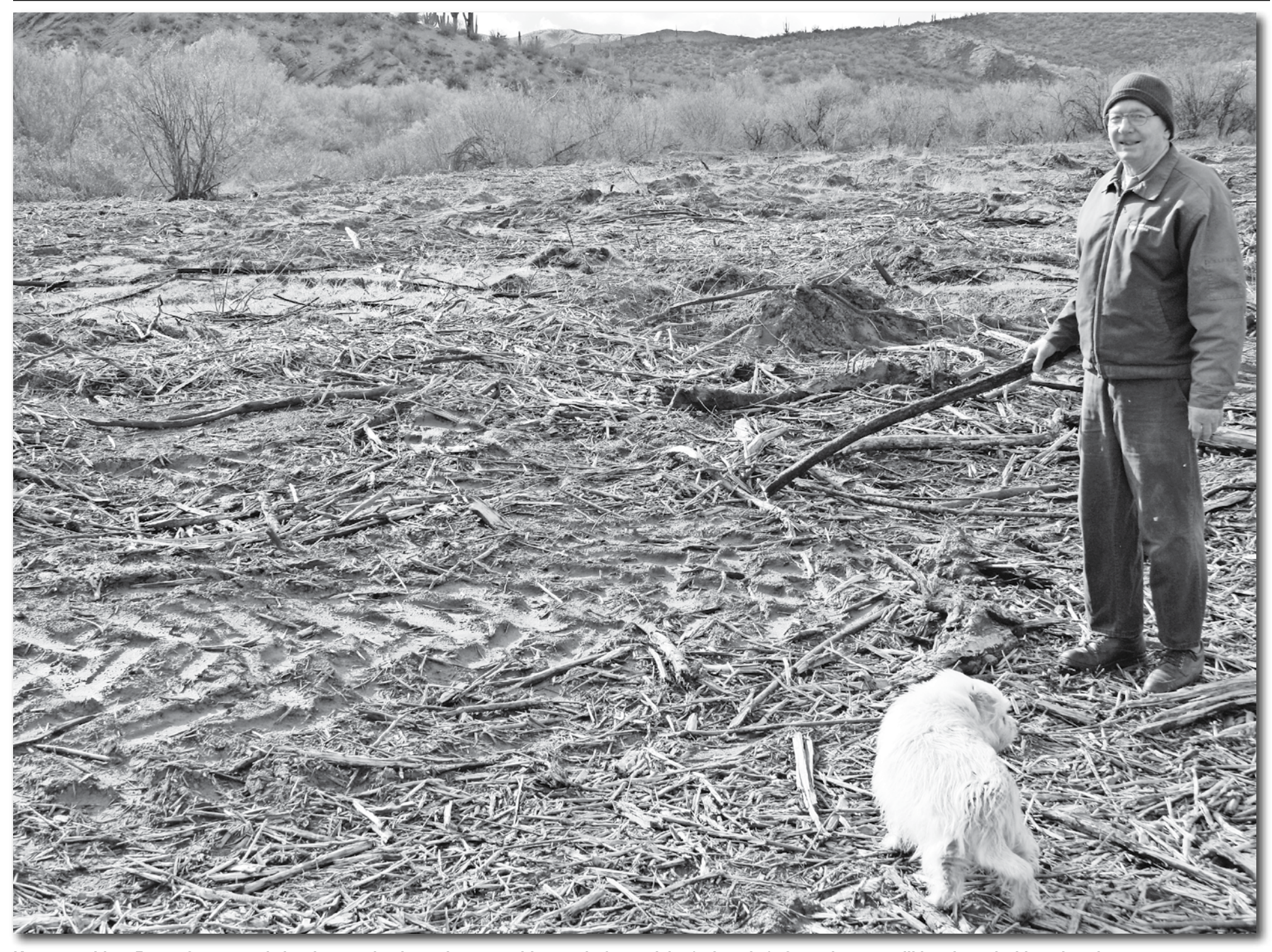
Kearny resident Roger Stern stands in what used to be an impenetrable stand of tamarisks (salt cedar). Soon the area will be planted with native plants.