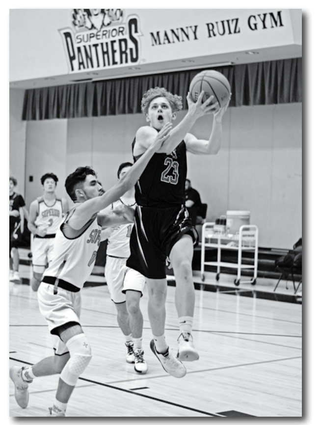
A Ray player going for a lay-up in the 49 - 46 loss at Phalicatee 'Pinky' Thomas