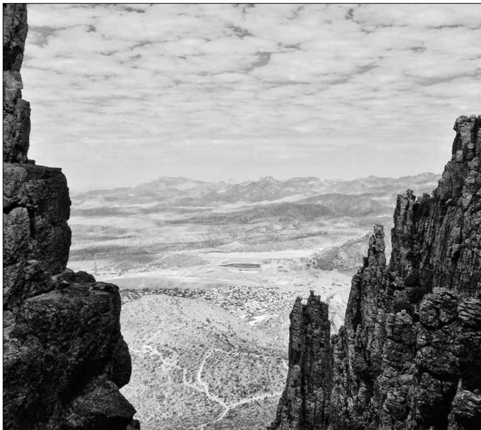
A view of Superior from atop Apache Leap. (File photo)