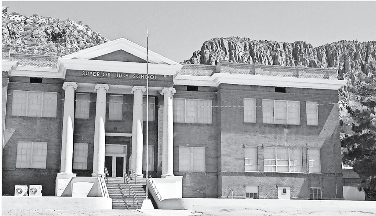
The Town of Superior will celebrate the newly acquired historic high school building at the Home & Building Tour.

Each year, attendees of the Home and Building Tour enjoy learning about Superior's fascinating history while observing how the town has been forging a unique new identity. Pre-sale tickets for the Tour are $15 at https://bit.ly/3tn5E4z . Sales at the door are $18. All ticket holders receive 2 for 1 tickets to the Renaissance Festival and the Boyce Thompson Arboretum! Please bring a mask as some property owners may require them for entry. For more information, please call the Chamber of Commerce at 520-689-0200.