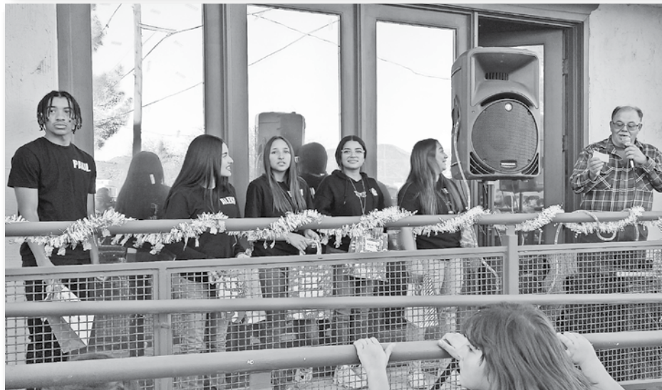
Copper Basin Jr. Chamber members.