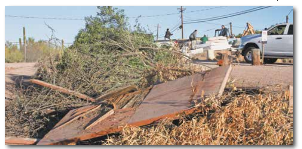
Brush is piled up and will be burned eventually.