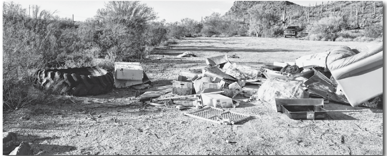
Footprints Matter to Us seeks to eliminate and mitigate trash in the desert at Saturday's event near Superior.

This event is possible because of the support of the Arizona Trail Association, the Arizona State Land Department and the Tonto National Forest,