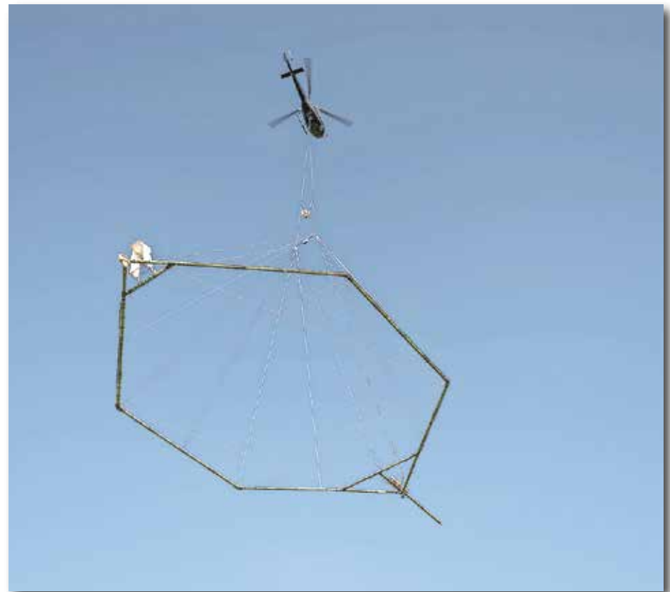
Survey equipment and aircraft similar to the one Kennecott will likely use. The hexagonal shape 60 feet wide bird is towed 130 feet below the helicopter. The data recording equipment is mounted inside the helicopter.

Please contact the credit union for full details of this account, including all terms, conditions and disclosures.