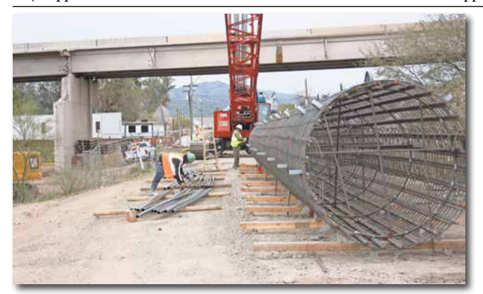
Construction continues on the Winkelman Bridge replacement. Above, workers prepare a large concrete form which will serve as a support for the new bridge.