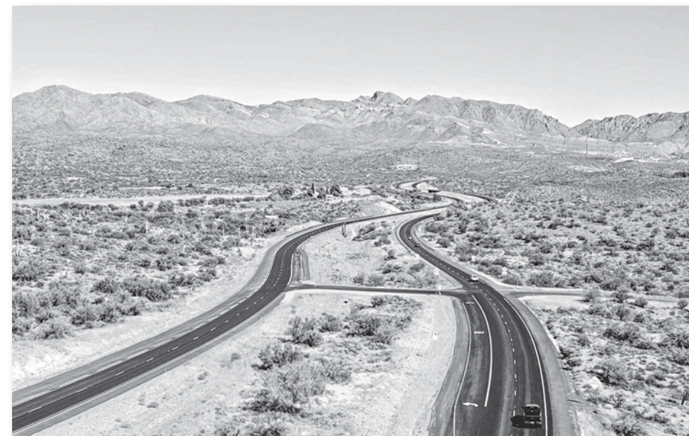
ADOT’s previous Silver King segment of US Hwy 60, Superior.