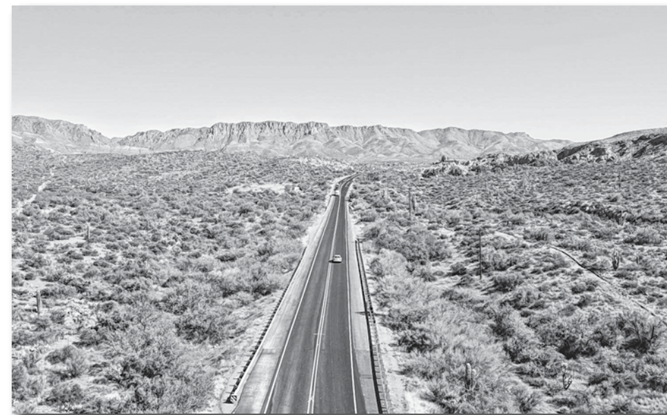
ADOT’s planned Silver King segment of US Hwy 60, Superior.