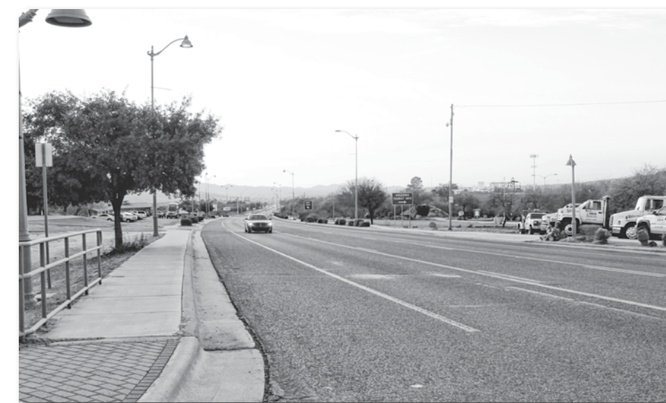
US Hwy 60 as it cuts through the Town of Superior. A planned widening will give it a much different look.