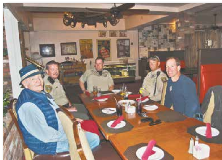
ONW members take three local Pinal County Officers to lunch.