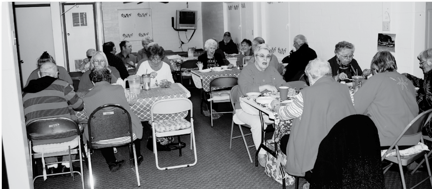
San Manuel seniors enjoy friendship and conversation during their monthly pot luck.