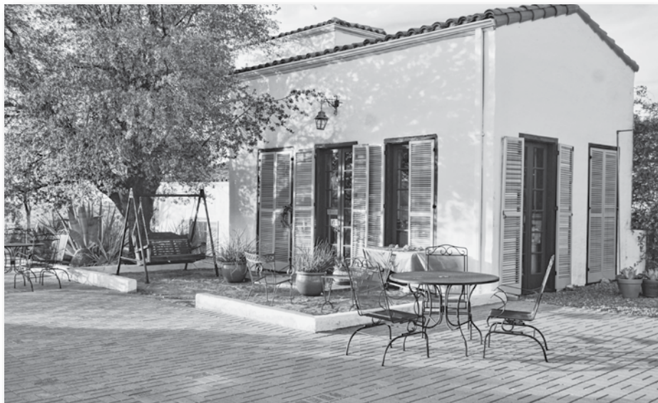
The patio at Kannally Ranch House, Oracle State Park, will be the site of a stargazing event Jan. 24 to celebrate the park's new International Dark-Sky designation.