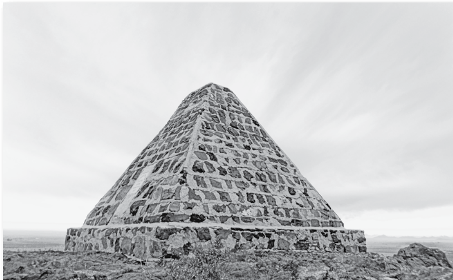
Poston's grave sits atop Poston's Butte near Florence.