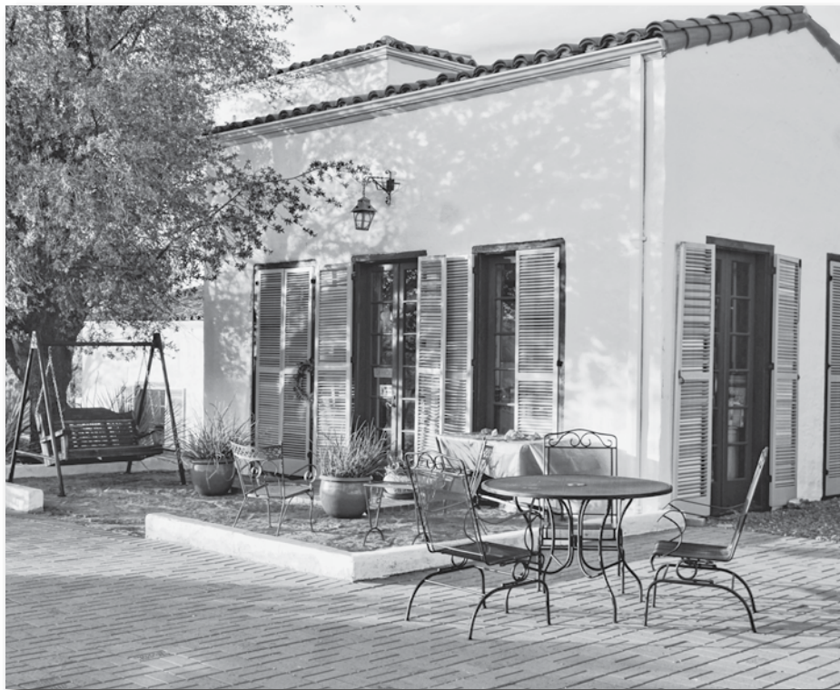
The patio at Kannally Ranch House, Oracle State Park, will be the site of a stargazing event Jan. 24 to celebrate the park's new International Dark-Sky designation.

The park entrance is on Mt. Lemmon Rd; admission is $7 per car. More information at 520-896-2425 or visit www.azstateparks.com/Parks/ORAC for details of many upcoming events.