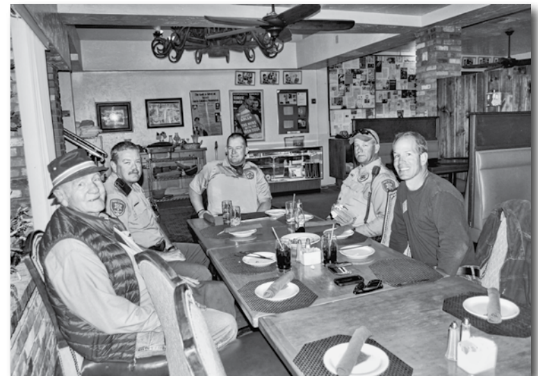
ONW members take three local Pinal County Officers to lunch.