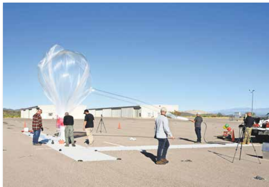
World View staff prepare for balloon launch at San Manuel Ray Blair Airport.

World View Enterprises, Inc., doing business as World View, is a private American near space exploration and technology company headquartered in Tucson, Arizona, founded with the goal of increasing access to and the utilization of the stratosphere for scientific, commercial, and economic purposes. They hope to offer human spaceflight experience beginning as soon as 2024.