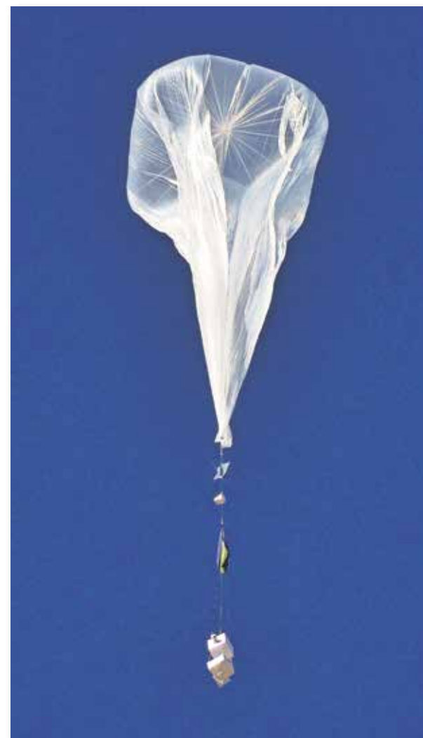
World View High-altitude balloon takes flight from San Manuel Ray Blair Airport.

Prep. In a turn from their previous game, the boys’ team was unable to secure the win, resulting in a 28-70 loss. The Lady Miners on the other hand, were able to turn it around from their last loss, and beat the Lightning. The final score of the girls game was 45-33. Up next for the Miners: On Thursday, the varsity boys head up the road to Winkelman for a one-off match against the Lobos. Tipoff is at 7 p.m. On Friday, Jan. 14, the Miners play host to the Leading Edge Academy-Gilbert. On Tuesday, Jan. 18, they will host the Ray Bearcats. Boys JV, girls varsity and boys varsity will play at 4, 5:30 and 7 p.m. respectively for both games.