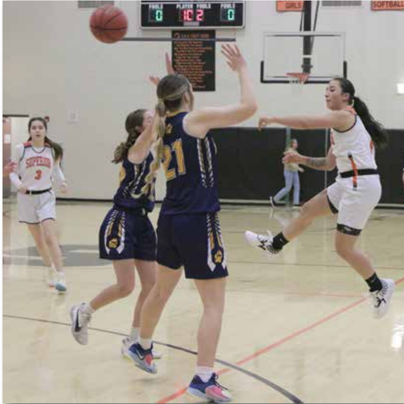
Superior hosted Joseph City this past weekend.

The Panthers and Lady Panthers will see Fort Thomas early in the week. Both teams will then host Dishchii'bi'koh on Jan. 13, with a start time of 5:30 p.m.