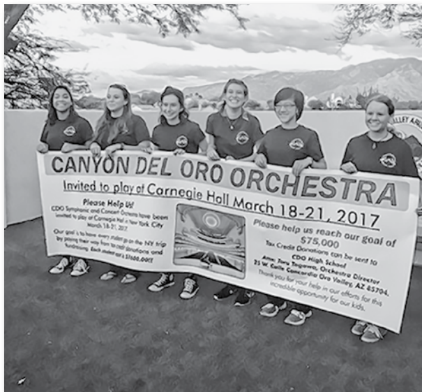
The CDO Orchestra will have a fundraiser on Sunday, Jan. 15, in Oracle.

A benefit concert to raise funds for the Canyon del Oro High School Symphony Orchestra will be held at the Oracle Piano Society's Oracle Center for the Arts on Sunday, Jan. 15, 2016 at 3 p.m. There is no admission charge but donations will be gratefully accepted at the Center.