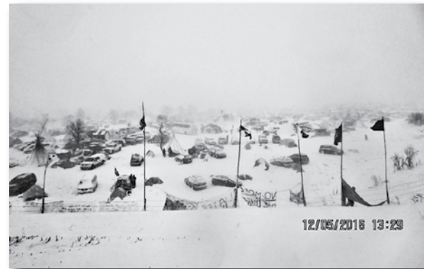
It was blizzard conditions at Standing Rock.

standing over me, and then all my dogs showed."