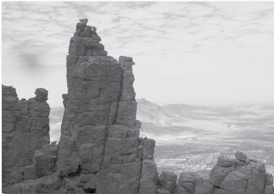
A view of Superior from Apache Leap.