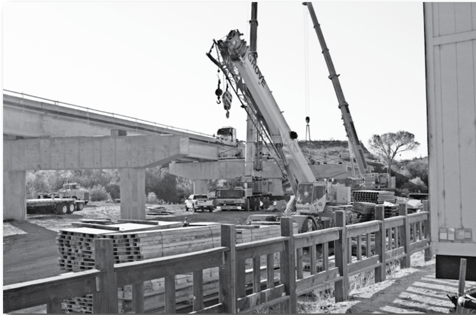
Construction workers carefully place bridge girders on the new Winkelman Bridge on SR 77.

visit ADOT's Traveler Information Site at www.az511.gov , follow ADOT on Twitter (@ArizonaDOT) or call 511, except while driving.