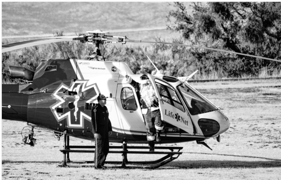
Santa's reindeer will be resting up, so Santa will be hitching a ride with the LifeNet EMS crew Friday. He will land at Mountain Vista School before heading over to the Oracle Fire Department.