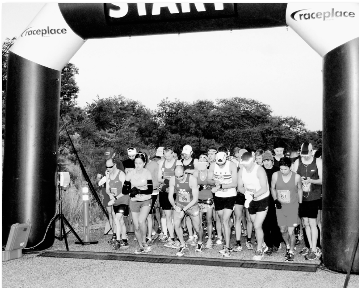
At the start of the 2015 Tucson Marathon.