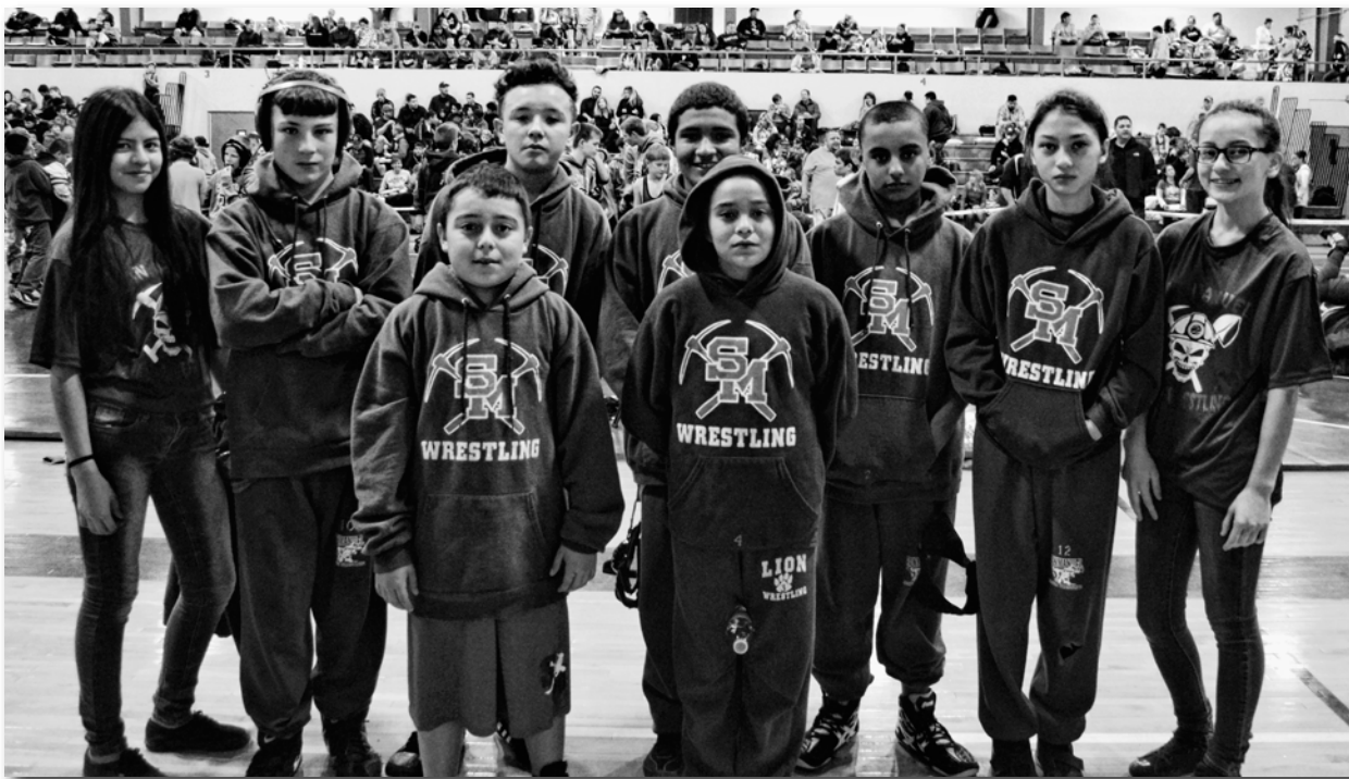
San Manuel Junior High wrestling team.