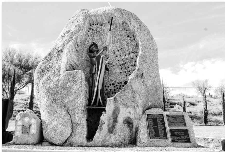
The Town of Mammoth's Miners Memorial daily honors those who were lost in the mine.