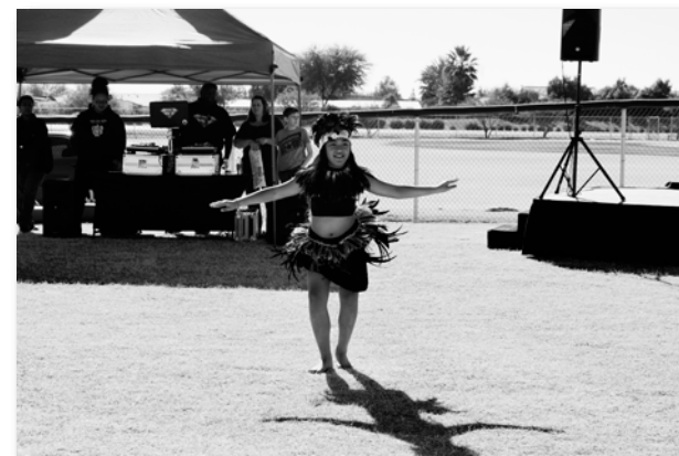
Natia O Le Pasefika Polynesian Dancers.