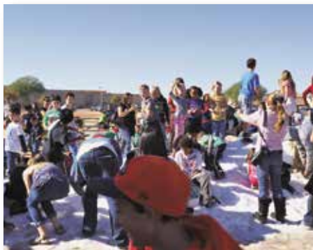
Finally, San Tan Valley gets snow!