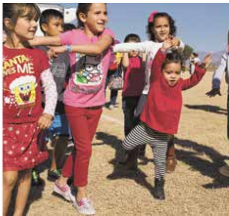
Hmmm? Electric Slide or Macarena?