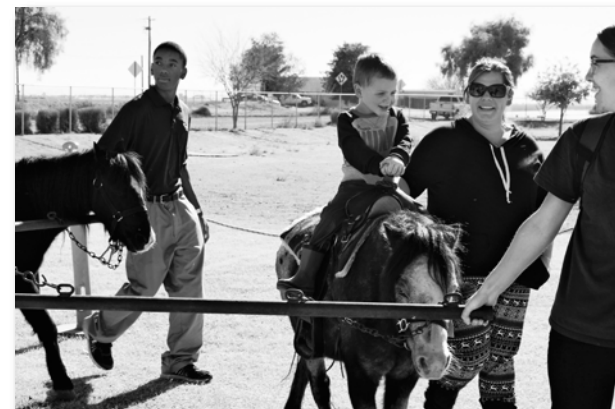
Pony rides! Need we say more?