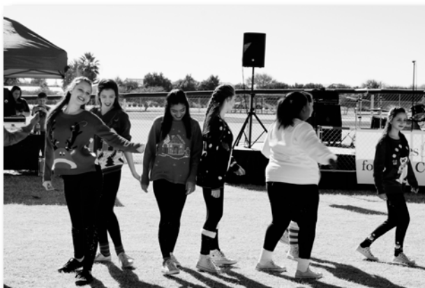
A parade of ugly Christmas sweaters.