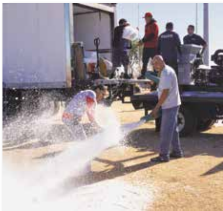
Here comes the snow!