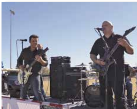
San Tan Valley's Tridon performs.