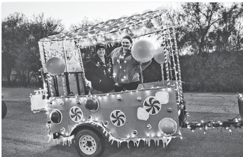
Copper Basin Railway's float