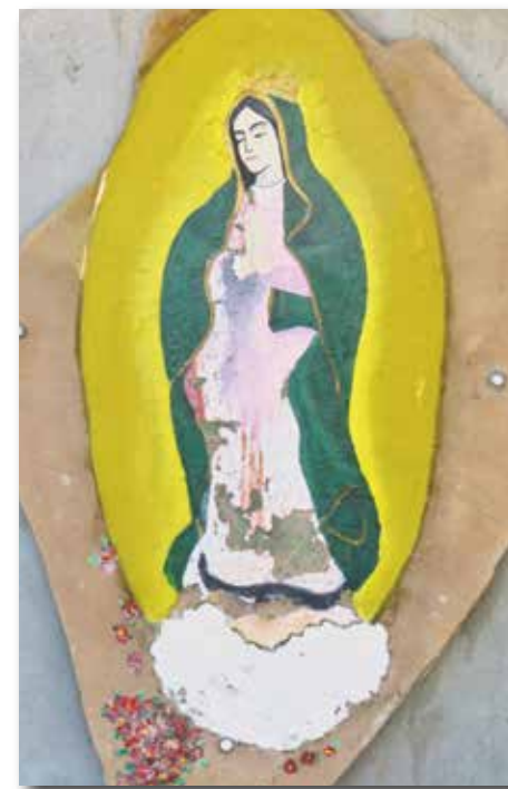
Virgen de Guadalupe