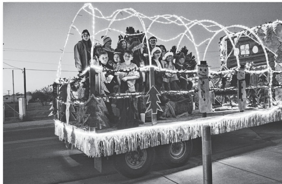
The Kearny Coyotes 4-H float