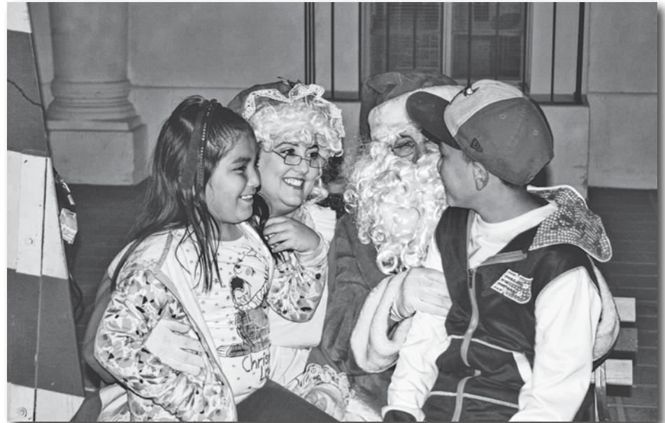
Visiting with Santa and Mrs. Claus