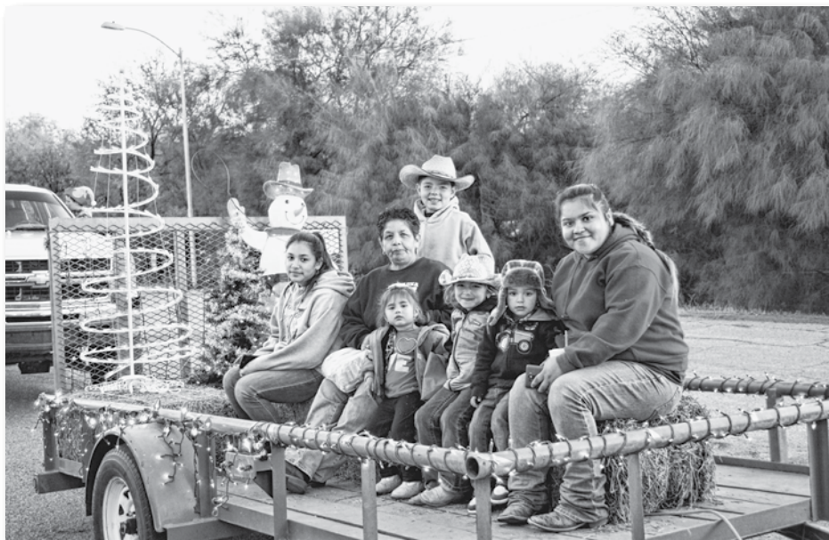
The Sanchez Ranch float