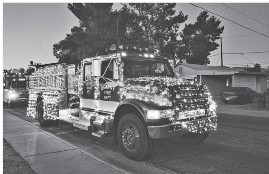
Kearny Fire Department's parade entry