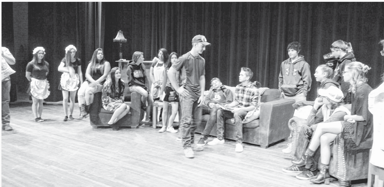
The Ray Players practice for their debut on Saturday.