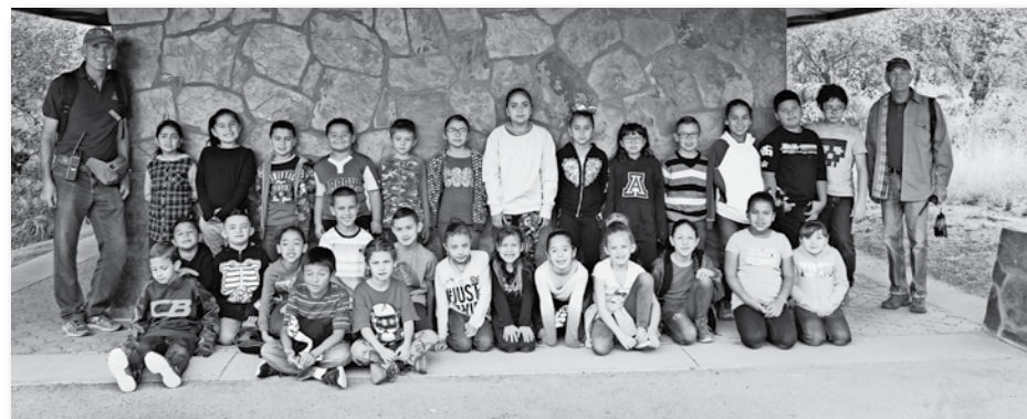
Mammoth STEM first, second and third graders.