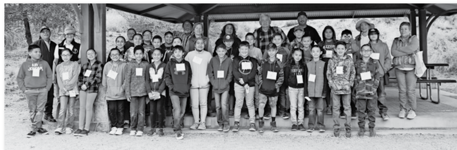
Mammoth STEM fourth, fifth and sixth graders.