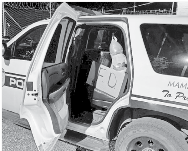
Vehicles loaded with presents for local families.

One, wishing to remain anonymous, donated $1,200. The police officers also contributed from their own pockets and the Dollar General in Mammoth donated over $100 worth of toys.