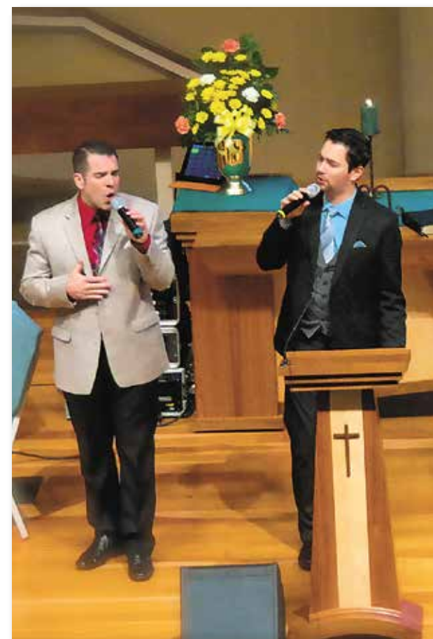
The Legacy Quartet in concert.