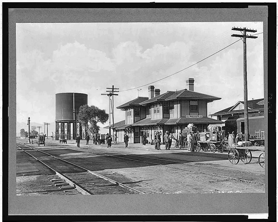
Maricopa Junction train station circa 1900-1920.

Sponsored by the Southeast Valley Ledger and QC Olive Garden