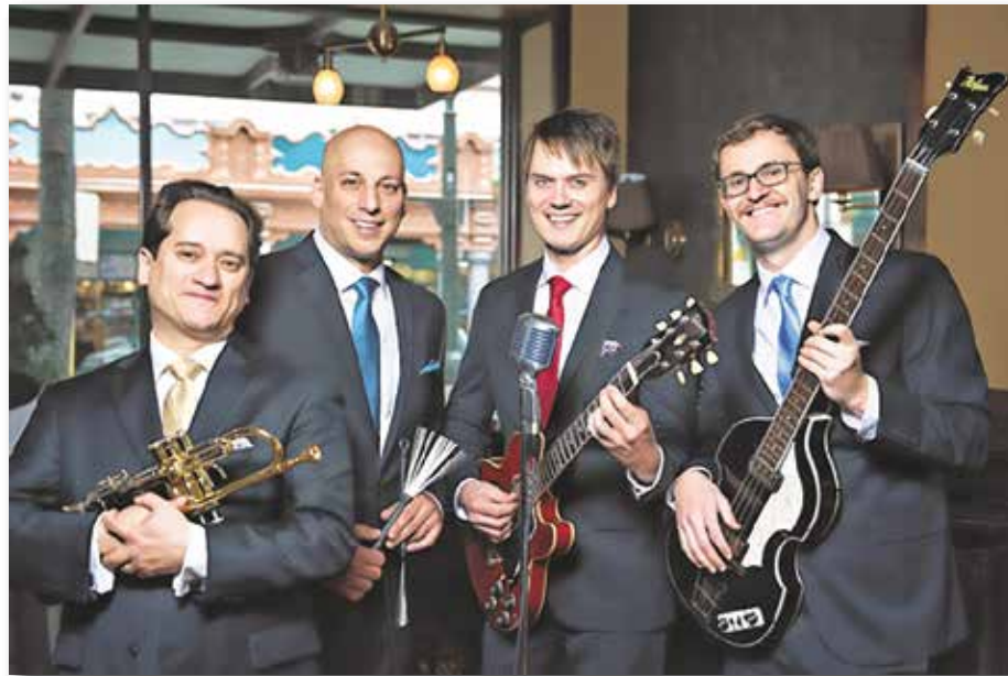
The Four Freshmen will perform in Gold Canyon Jan. 15.