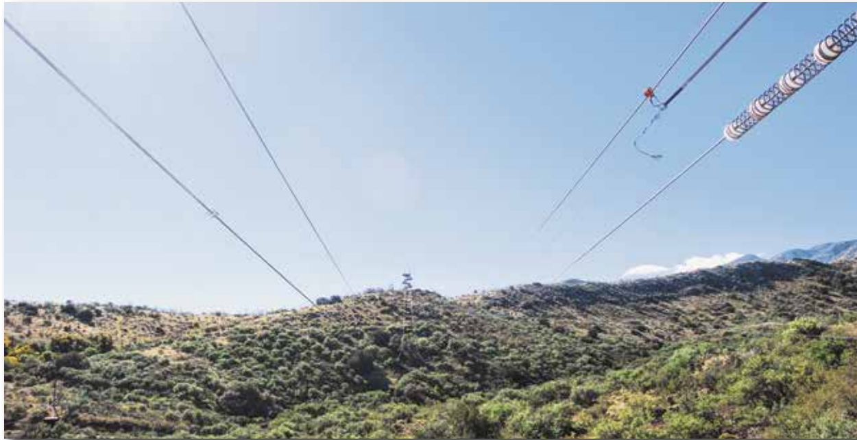
Looking up to the 30 ft. tower of the 1,500 foot run on the Arizona Zipline Adventures.