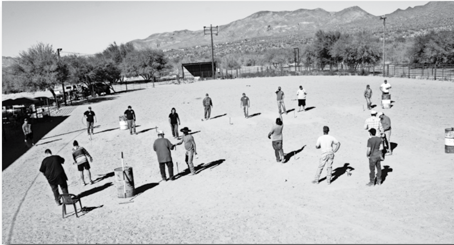
Several participants were competing at the same time.