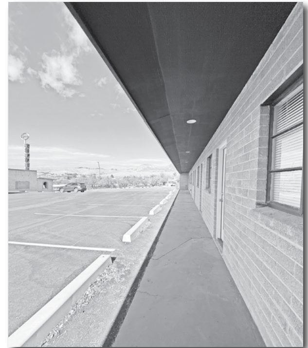
The Copper Bottom Apartments are providing some much needed housing in Superior.

The developers plan to remodel and repair the old Ritchies Bar into an event venue and they hope to begin construction on that in early 2022. The venue will be available for parties and meetings.