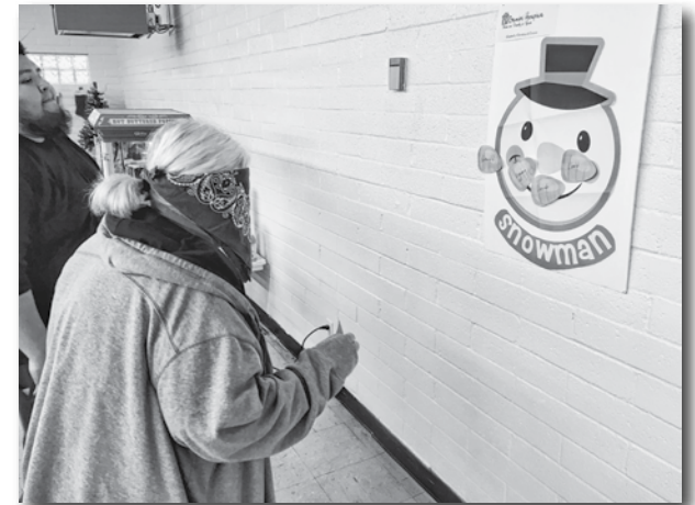
Pin the nose on the snowman.

Once the games were over, everyone settled down to a delicious Christmas meal.