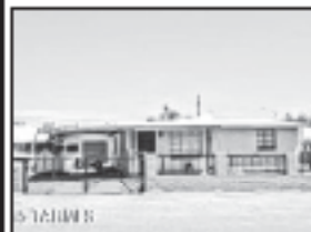
109 E. 2nd Ave, Mammoth MLS#: 21514927

• DW 3 bedroom Mobile home on 1.4 acres with views with double garage $139,000. MLS # 21618793