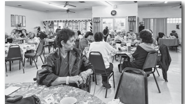
It was a full house at the annual Christmas party at the Superior Senior Center.

Resolution Copper partnered with the Superior Rotary Club and Superior Food Bank in packing more than 300 boxes of non-perishable food at the Food Bank just in time for the holiday distribution.