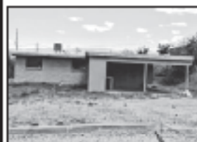
411 S. Rolfs Ave., Mammoth MLS#: 21612425

Nice well kept home, new carpet in 2012 newer paint inside and out. Detached 1 car garage with electric, and 1 car carport. central A/C fenced front and back yard. Great views. $72,900