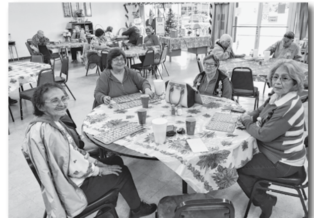
Ready to win some pastries in the Pastry Bingo.