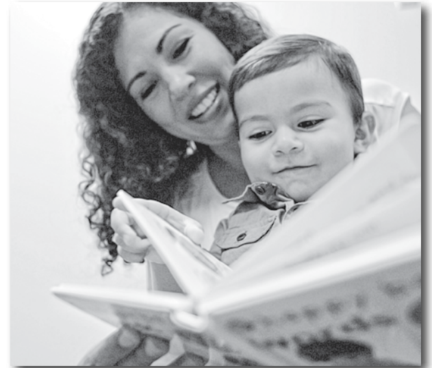
First Things First encourages parents to read to their babies, toddlers and preschoolers every day for 20 minutes. For more information visit FirstThingsFirst.org .

About First Things First – First Things First is a voter-created, statewide organization that funds early education and health programs to help kids be successful once they enter kindergarten. Decisions about how those funds are spent are made by local councils staffed by community volunteers. To learn more, visit FirstThingsFirst.org .