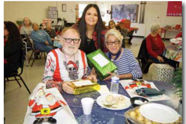
The Superior Senior Center hosted its annual Christmas party with the help of the Superior Youth Council. There were games and gifts and Santa Claus made a visit for the festivities. A fun time was had by all.