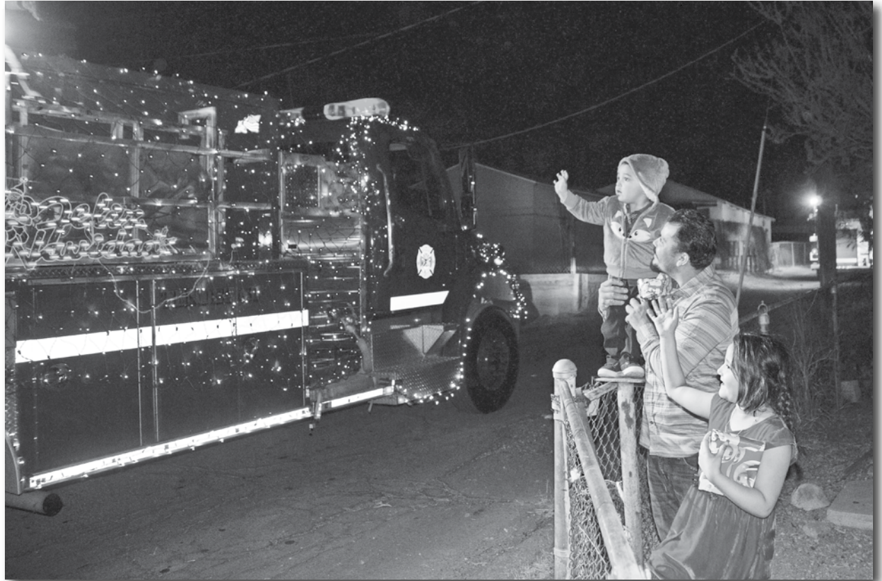
Volunteers and public safety personnel from Superior Police and Fire and Air EVAC made the annual trek through the streets of Superior to deliver Santa Claus, gifts and Christmas cheer to youngsters and young-at-heartsters. All headed outside to wave at Santa and his elves.