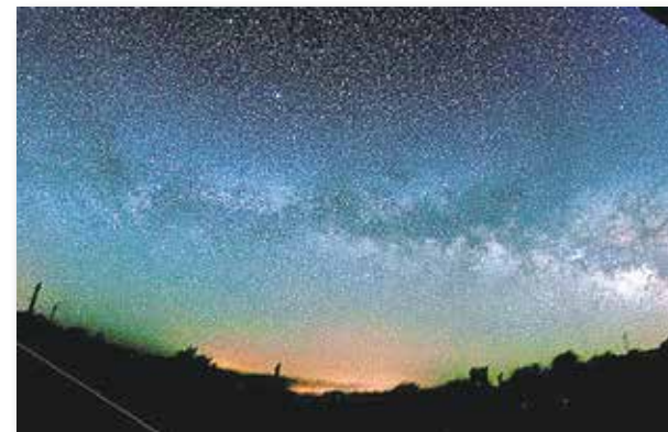
Milky Way at Oracle State Park.

an appointment at the clinic call 520-825-8100.