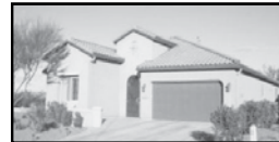
60402 E ARROYO VISTA DR. MLS#: 21329628