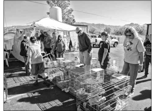
Those attending the Charlotte's Way Rescue fundraiser look at the animals up for adoption.