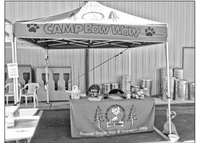
Camp Bow Wow was one of the sponsors.