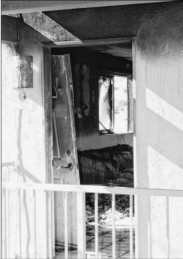
Two families were displaced by a fire at the Mammoth Apartments on Dec. 16.