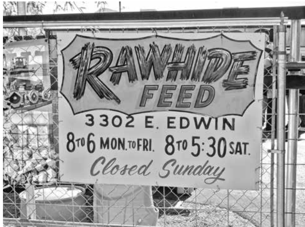
Rawhide Feed in Catalina was the main sponsor for Charlotte's Way Rescue's event. It was also the location.