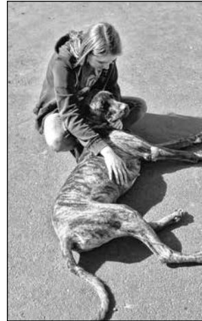
Two potential 'best friends' commune in the sun.