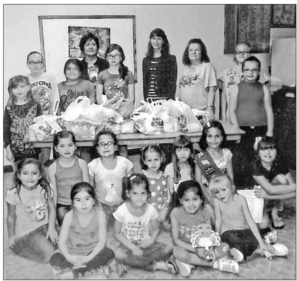
Girl Scouts from the Copper Basin area gathered food for the Knights of Columbus for their November service project.

Pregnant? Need Help? Call the Family First Pregnancy Care Center at 520-8969545