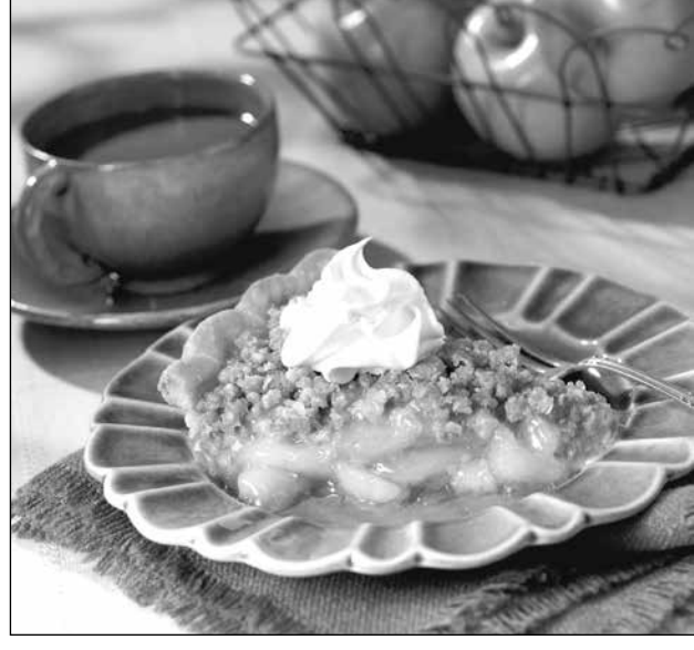
Apple Crumble Pie

Don't let your desserts take a back seat to the rest of your holiday food. With a quick rosette of real whipped topping, you can pack a big taste punch that's fuss-free, leaving more time for making memories.