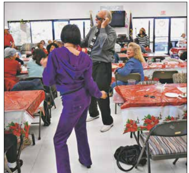
challenged some the audience to "Twist!"