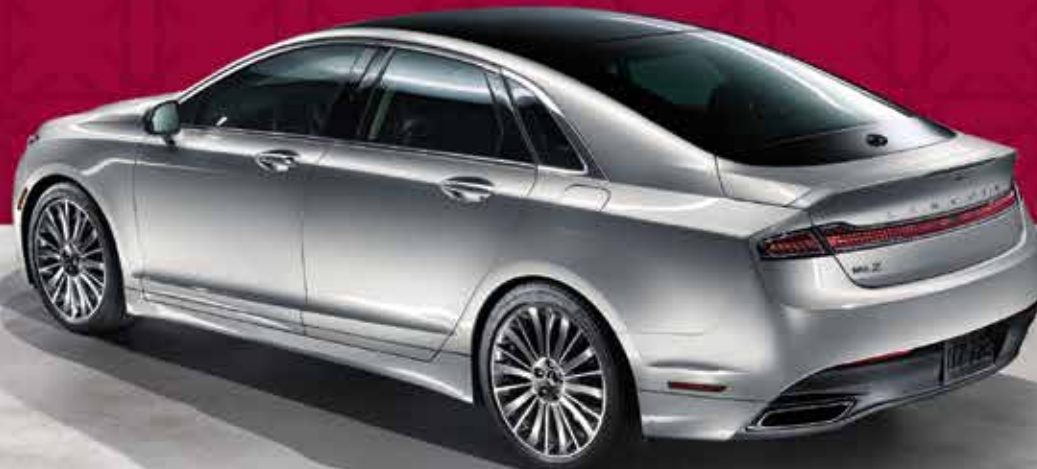
2013 LINCOLN MKZ

The time of the year when wishes really do come true.