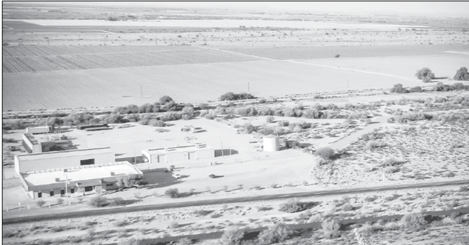
Florence Copper from above. The property straddles the Florence Town limits.