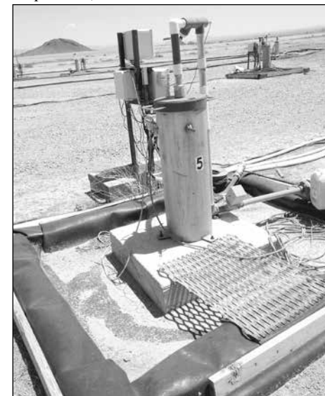
An injection site at Florence Copper.

Florence Copper is an established Arizona corporation, and is an initiative of Curis