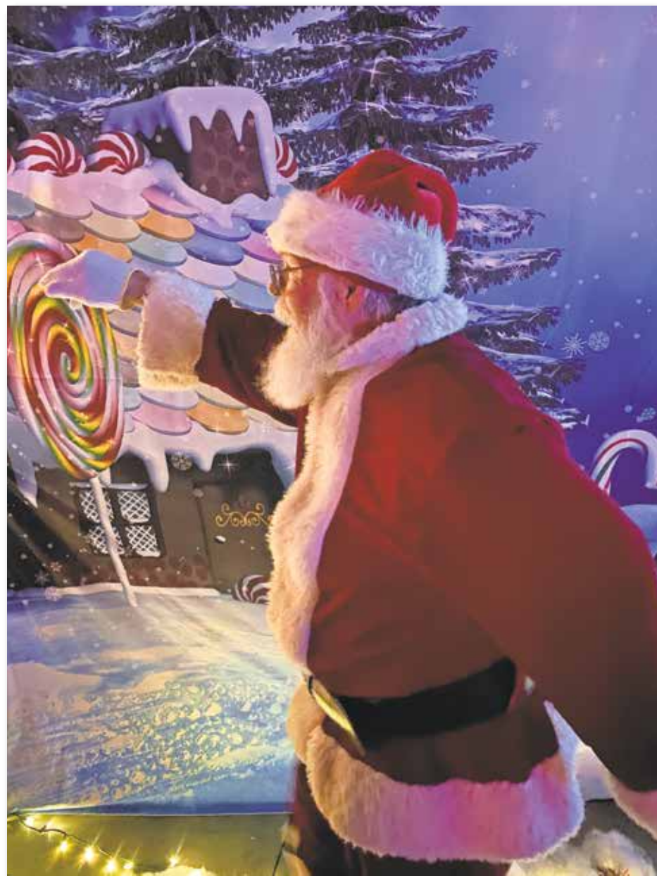
Above, Santa Claus waves to children and parents driving through the 'Winter Wonderland' set up in Superior's Fire Station. At right, Santa's helpers stand ready to distribute Christmas goodies to the good kids of Superior.