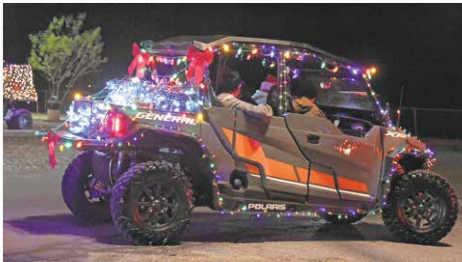
Above and below, Decorated vehicles from the light parade went to see Santa Claus after parading through the town.