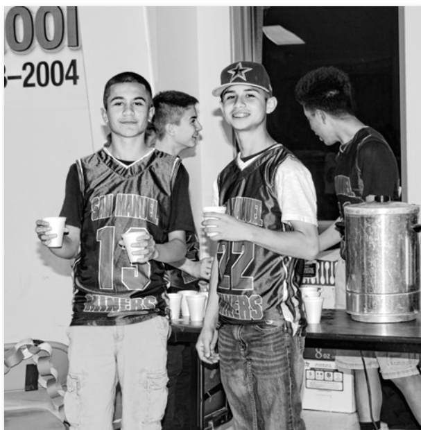
Big brothers were welcome at the Family Fun Night at First Avenue.