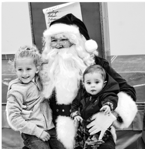
The evening of family fun at First Avenue Elementary was capped off by a visit from the man of the season, Santa Claus.