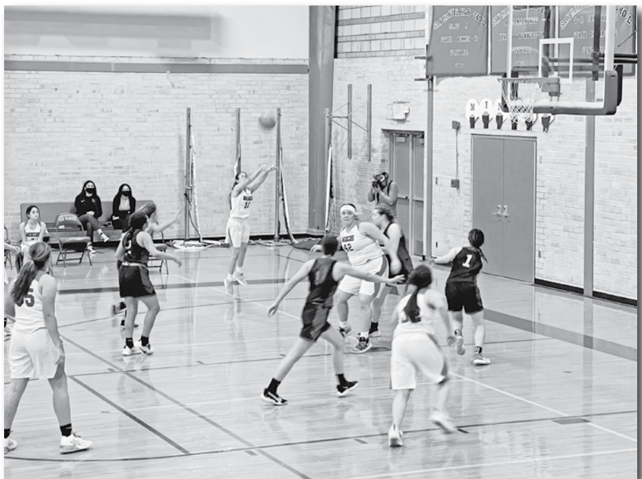
The Lady Miners work together to put one in the basket.