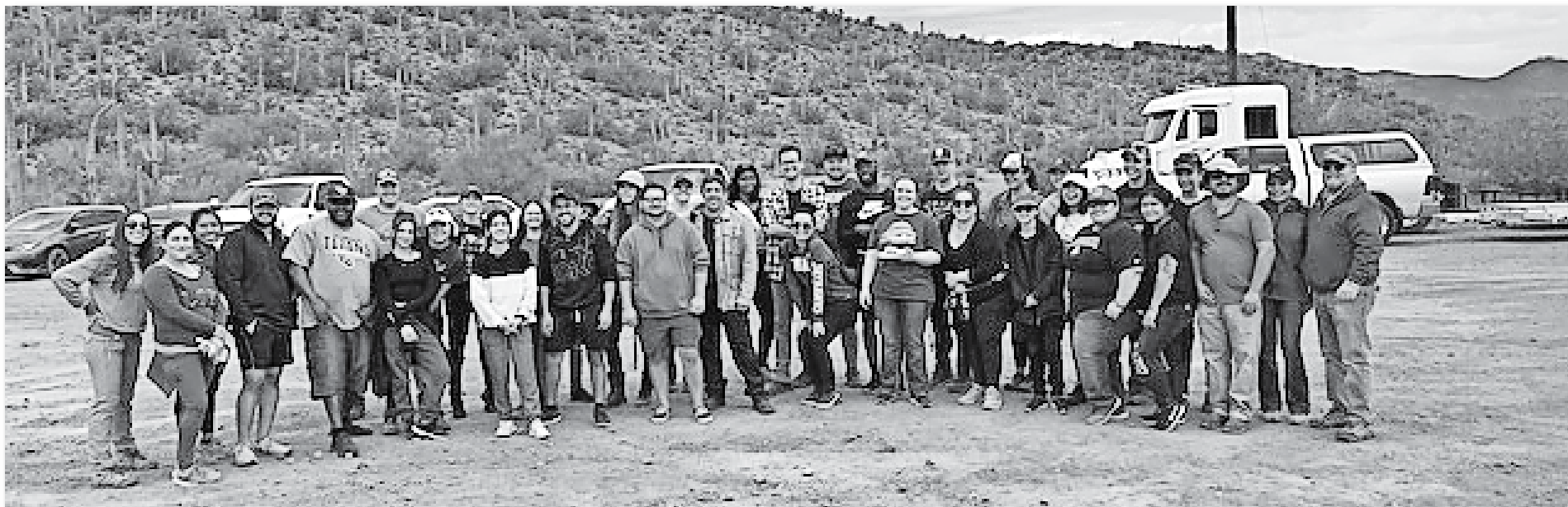
Students from Central Arizona College spent two days cleaning the Arizona Trail near Winkelman.