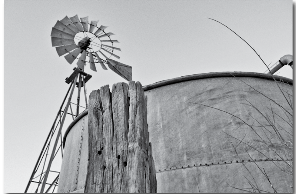
This is the landmark for the Oracle State Park's Windmill Trail.

Resources. Help. Community Wellness. slfhc.org