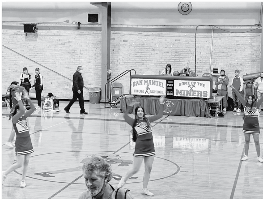
The Cheerleaders get the crowd worked up before the game.