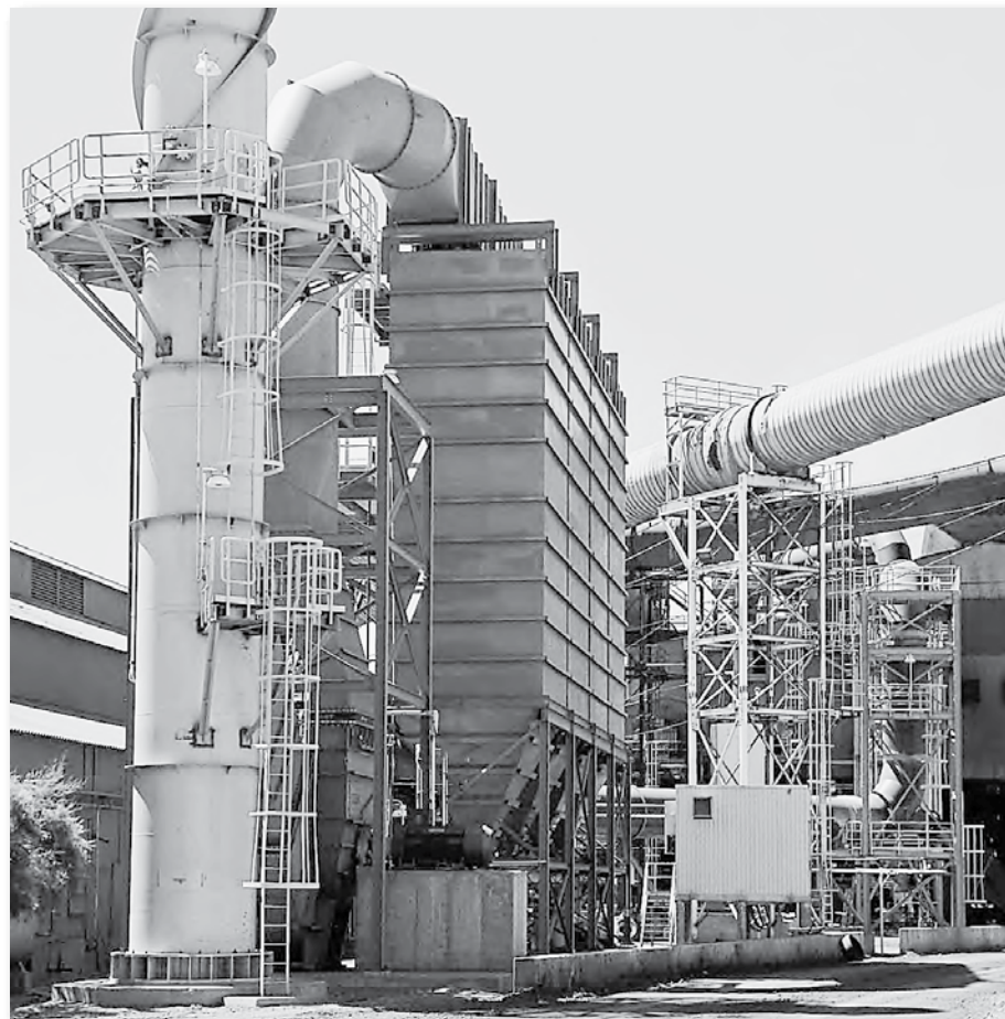
Asarco's smelter in Hayden.

Public hearings on the Hayden Lead rules will be held January 10 at 2 p.m. in Room 3175 at ADEQ, 1110 W. Washington St., Phoenix.