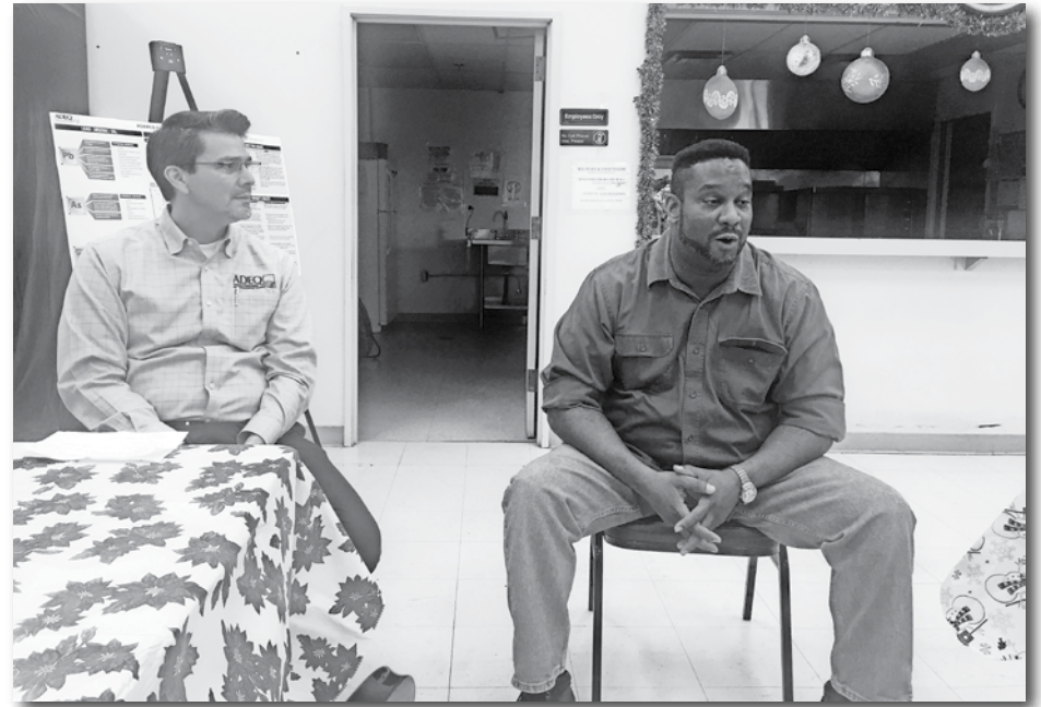
Officials from the Arizona Department of Environmental Quality visit with residents of Hayden to discuss air quality.